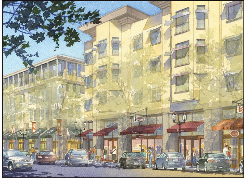
Artist Rendering of Sycamore North Development which is currently under construction

If you would like to attend, please call the Affordable Housing office at: 510-245-6517 to RSVP by May 14th. You may also call our office if you would