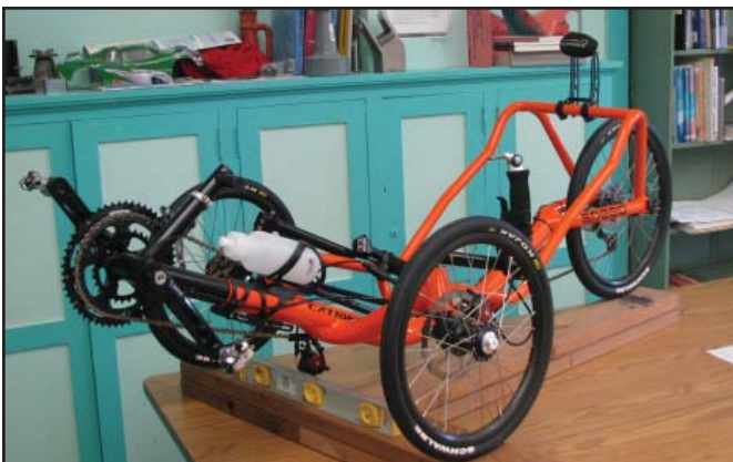
In the Careers Academy CAD class, students replicate goods such as this Catrike Speed. The Catrike Co. has been donating parts free of charge for the students to model