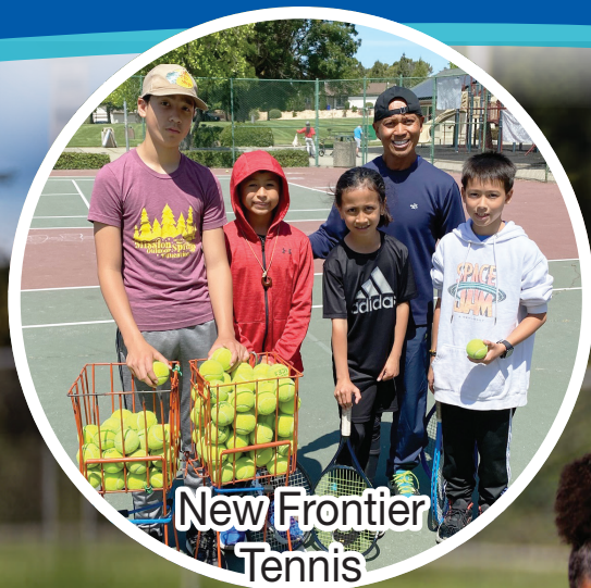
New Frontier Tennis