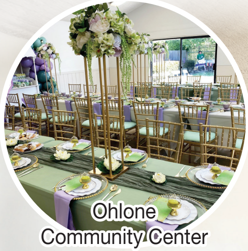
Ohlone Community Center