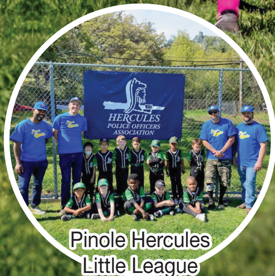
Pinole Hercules Little League