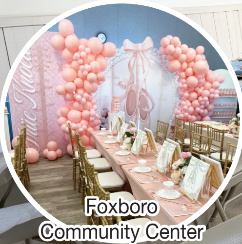
Foxboro Community Center