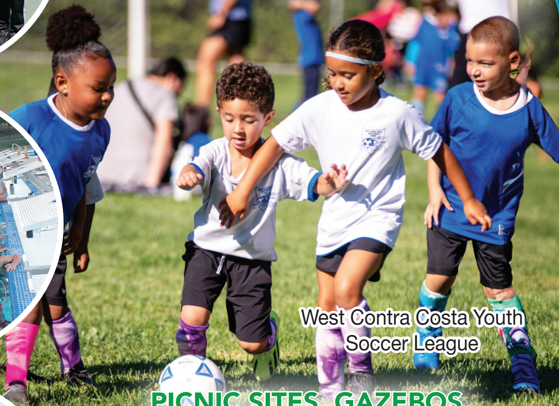
West Contra Costa Youth Soccer League

PICNIC SITES, GAZEBOs, FIELD RENTALS TENNIS/BASKETBALL COURTS, AND MORE!