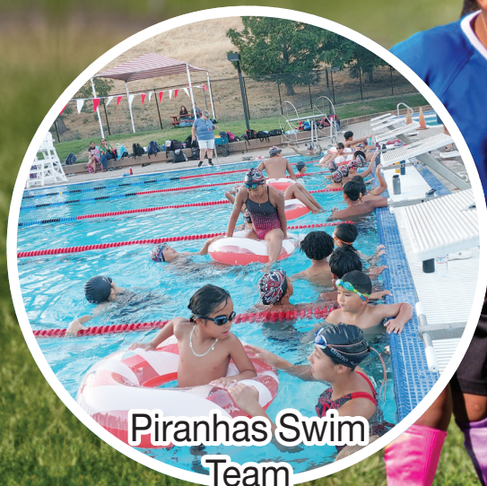
Piranhas Swim Team