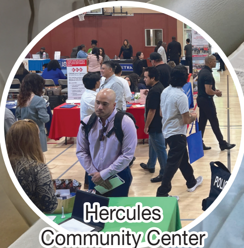
Hercules Community Center