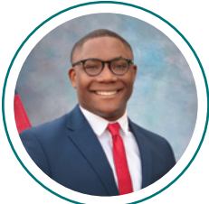
ALEXANDER WALKER-GRIFFIN MAYOR