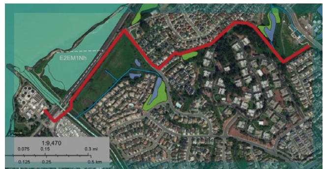
Sycamore Avenue Lower Sewer Trunk Main Capital Improvement Project

A recent major project the Public Works Department has undertaken is Sycamore Avenue Lower Sewer Trunk Main Capital Improvement Project. The construction of this $14 million dollar project is now underway and will replace a mile of sewer pipe that has aged out of usage and must be updated to City standards. The older, 24-inch pipe will be replaced with a larger 30-inch pipe that will convey the increase in flow out to City buildout.