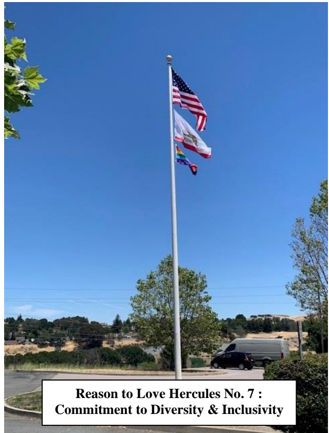
Reason to Love Hercules No. 7 : Commitment to Diversity & Inclusivity

The design plans are under review for the Sycamore Crossing development project, including the EBMUD relocation of the waterline into San Pablo Avenue and hotel. The City finally received permits from regulatory agencies so the Sycamore Trunk Sewer Replacement Project can now be bid out. This project will replace a long segment of sewer trunk main leading into the Pinole-Hercules Water Pollution Control Plant. Design on the Regional Intermodal Transportation Center (RITC) is advancing utilizing $1.2M in grant funding and the City has contracted with GBS who is developing a funding plan to complete the project. The sewer conveyance system for the Willow Storage Facility Developer is under review. The Sycamore Avenue Rehabilitation Project is being bid out with an anticipated Council award date at the second meeting in July. Staff is reviewing a surcharge grading permit for what known as the “Bowl” or Blocks ABCD located at the corner of Bayfront and Railroad. This area is part of the Bayfront Development and while the soil preparation is underway a project has not yet been approved for this site.