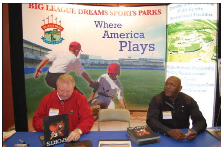
Baseball legends Bill Russell and Vida Blue sign autographs and provide information on Big League Dreams Sports Parks