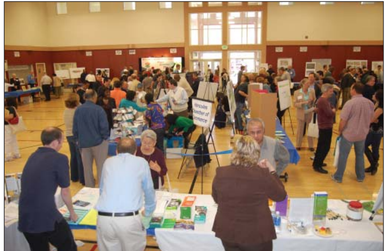
At the Community Update, attendees are free to walk around the Community Swim Center and go to the tables that interest them