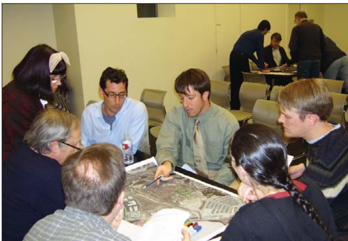
Small groups discuss their ideas for the Refugio Creek Watershed at a vision planning meeting

For more information, including updates and project presentations, please visit the Refugio Creek Watershed Vision Plan web page on the City's website at: www.ci.hercules.ca.us/index.aspx?page=523 , or contact the Planning Department at 510-245-6531.