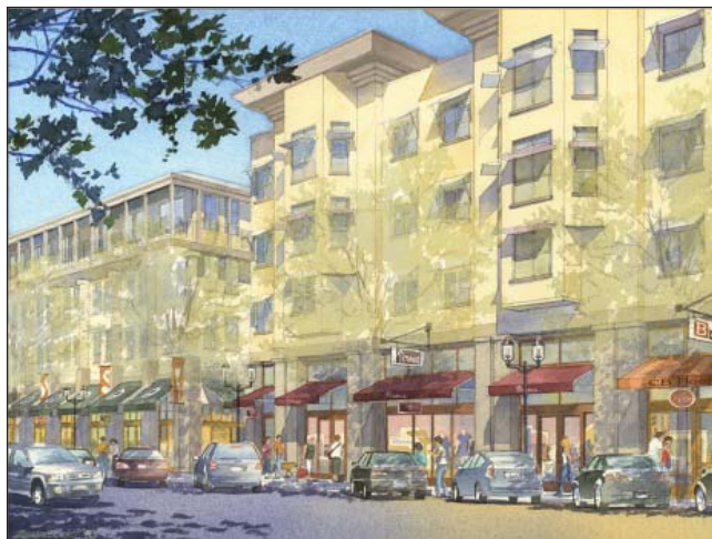
Sycamore North is set to break ground this month, join us for the ground breaking celebration on May 12, 2009