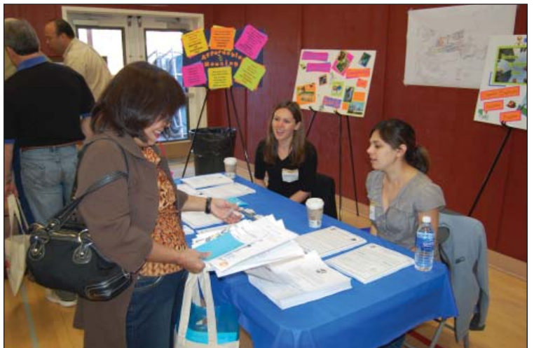
An interested resident picks up information from the Affordable Housing table, one of the many programs and projects who distributed information at the event