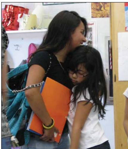
Cadets are greeted with hugs when they arrive