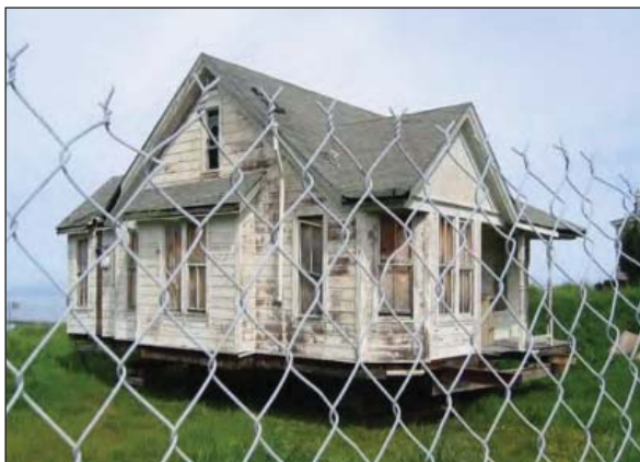
Historical structures are valuable resources to the community but can also be considered “blight” for Redevelopment purposes