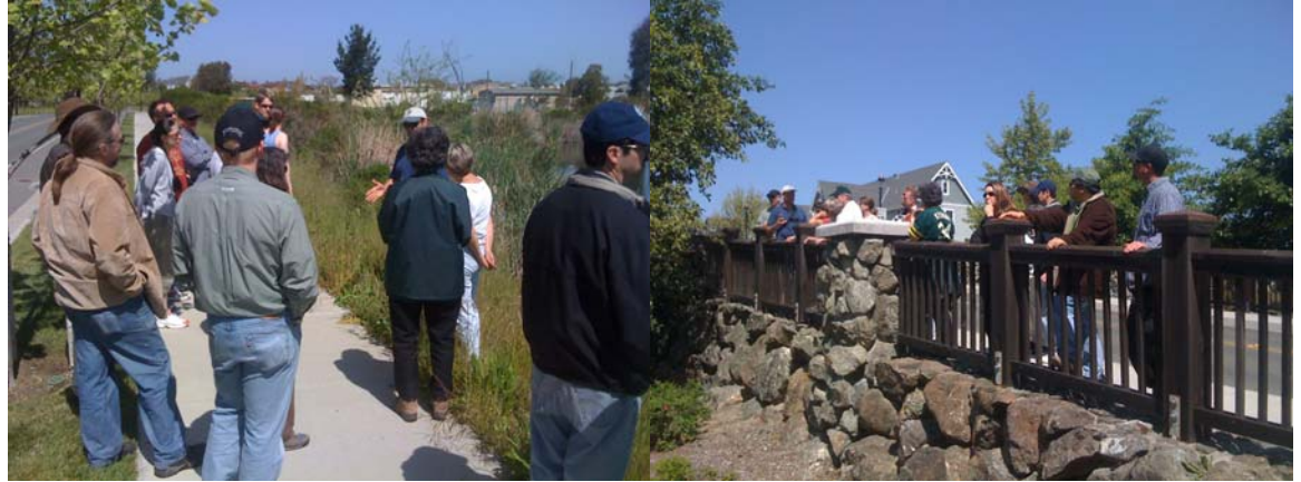
The vision planning group discusses the ponds in the lower watershed.