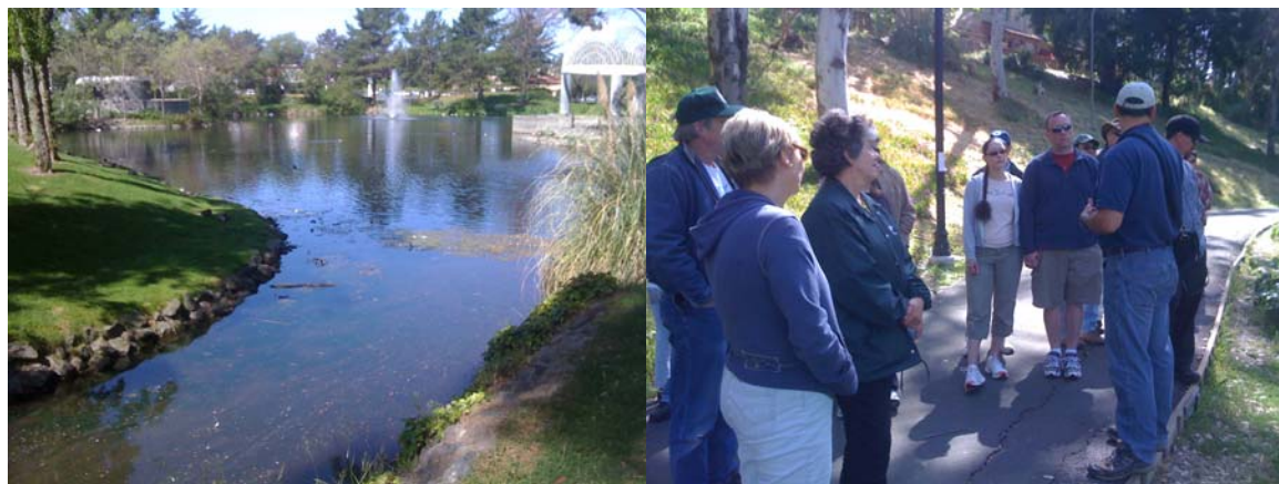
The vision planning group examines Refugio Valley Park.