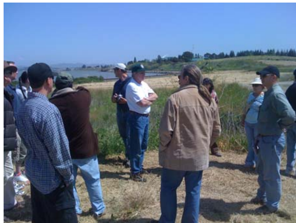
The vision planning group gathers at the mouth of Refugio Creek.

The group stopped near the mouth of the creek. The group discussed the plans in the area including the planned ferry terminal and Amtrak station. It was nearly high tide and the tide extended approximately 600 feet inland. This suggested to the group that the tide would not extend far enough inland to flush the Lower Ponds or Duck Pond.