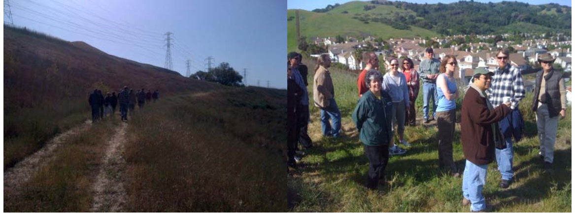
The vision planning group gathers at the top of the watershed.