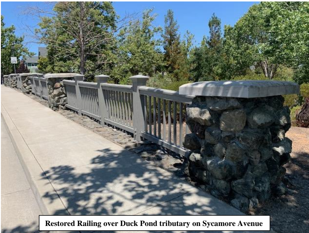
Restored Railing over Duck Pond tributary on Sycamore Avenue