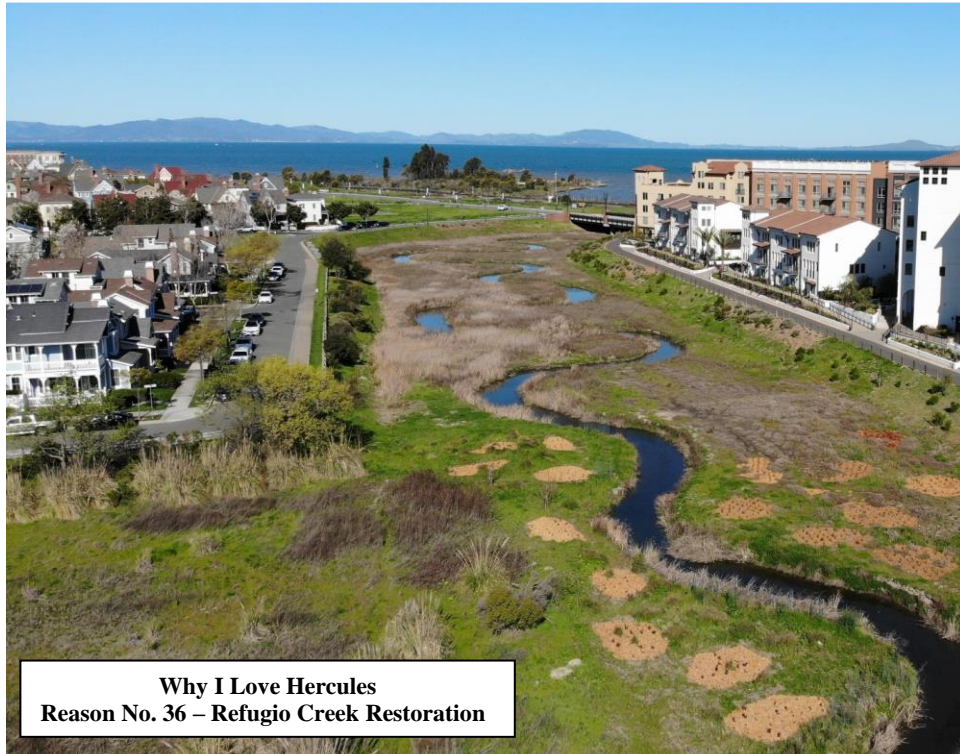
Why I Love Hercules Reason No. 36 – Refugio Creek Restoration