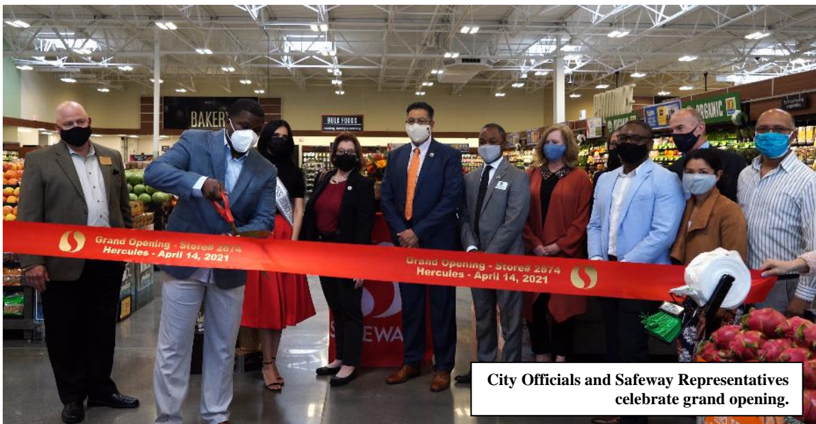
City Officials and Safeway Representatives celebrate grand opening.

Safeway Shopping Center is now open! We encourage all to visit the new Safeway Grocery Store, Chase Bank, and Peets Coffee located at the corner of San Pablo Avenue and Sycamore Avenue. You can find the Safeway Hercules Press Release attached as the last pages in this edition of this newsletter.