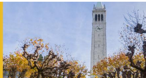
College Readiness: Class of '22 and Beyond Tuesday, January 12th, 2021 on Zoom

If you're planning on applying for college in the next few years you should know some of the big changes that are coming. A presenter from the Princeton Review will go over what you should be doing to make the perfect college application. There will be plenty of time for Q&A during the presentation and at the end.